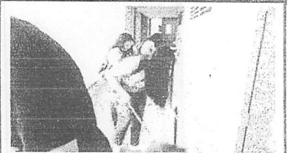
Photo taken during the cleaning on the afternoon

Due to the earthquake happened last 2017, the Engineering building was damaged and now is already repaired and ready to be use. But because of the repairing and construction happened in the building, it was still mess and many trashes, dust and dirt was scattered in the area. By this reason, the College of Engineering and Information Technology Officers decided to conduct a Hygiene Improvement of Natural Land Operation (HINLO) and it was actively participated by the student buddy last January, 26 2019 at the 3 rd and 4 th floor Engineering Building. The HINLO activity is very important in preparing the classroom for the resume of classes so that the classroom will be use and the demand of classroom will be partly solve while the construction of more classroom is on its way.