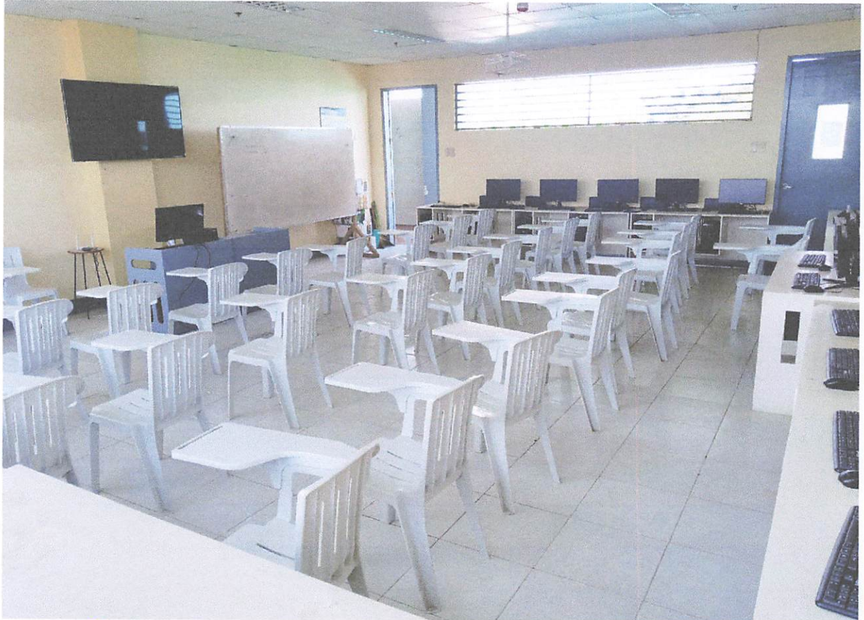
JMC JONAS E. DELA CRUZ Photo Taken