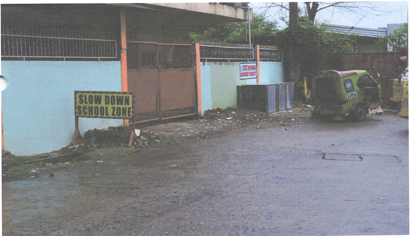
S.4.1 traffic safety in and outside the campus